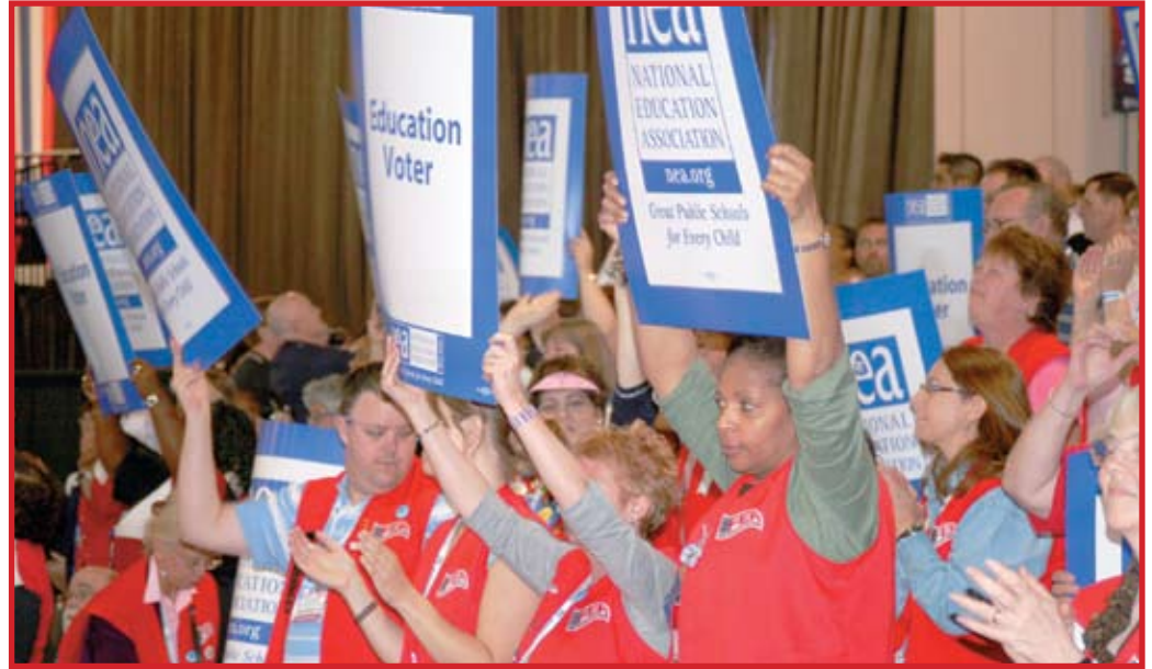
DEMOCRACY IN ACTION – FEA delegates to the 2007 NEA Representative Assembly welcome one of eight presidential candidates who addressed attendees at the meeting. The RA mixes serious debate and discussion with fun, uplifting presentations.

The FEA Annual Membership Meeting will be held at the Omni Shoreham Hotel in Washington DC June 30 and July 1. The meeting is open to ALL FEA members. Although no pre-registration is needed to attend the FEA meeting, it is suggested that those interested in