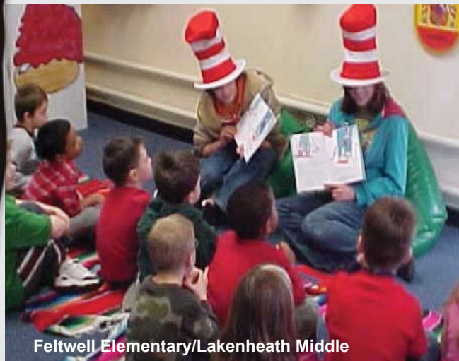
Feltwell Elementary/Lakenheath Middle